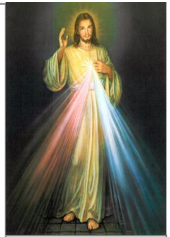
Divine Mercy Sunday Sunday after Easter, Feast of the Divine Mercy