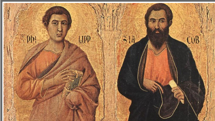
3 May 2021: Joint Feast Day of Saints Philip and James

Philip, a disciple of Jesus and one of the twelve. Recorded in the Fourth Gospel as recognising in Jesus the one foretold by Moses and the prophets (John 1:45). James, also one of the twelve, known as James the Less, author of the Letter of James and was leader of the Church in Jerusalem.